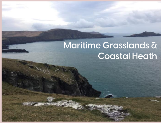
Maritime Grasslands & Coastal Heath

Choughs forage for invertebrates in short maritime and agricultural grasslands.