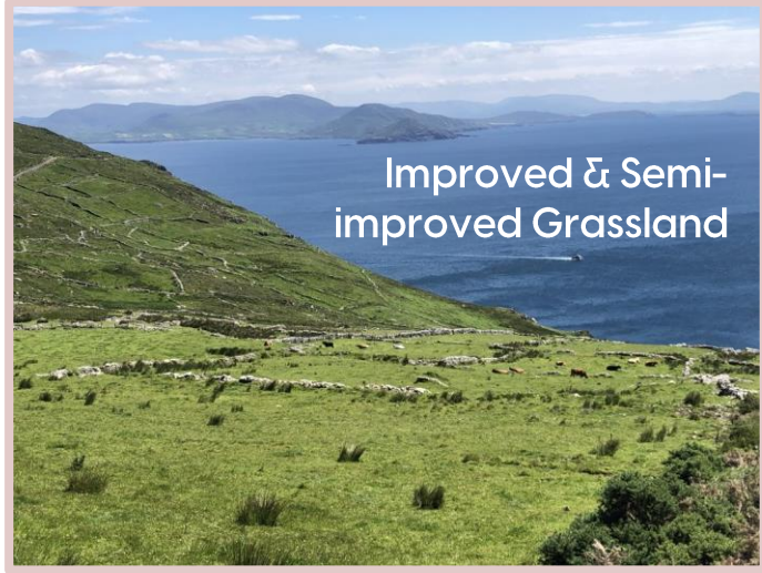
Improved & Semi-improved Grassland

You will sometimes see choughs foraging on dune systems, or along the strandline at low-tide.