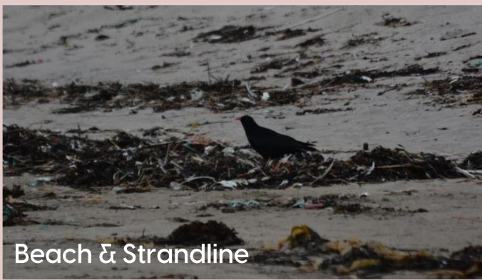
Beach & Strandline

You will sometimes see choughs foraging on dune systems, or along the strandline at low-tide.